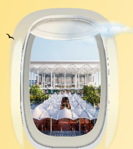
NOIDA INTERNATIONAL AIRPORT, JEWER